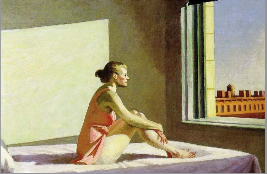
Morning Sun, Edward Hopper, 1952